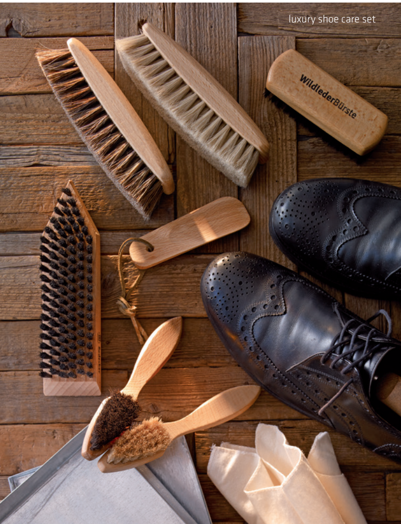
luxury shoe care set