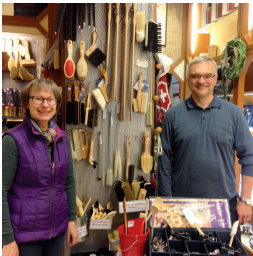
Family Preuss midst of their Redecker product range.

switched its focus: We got to know one another during a visit to our stand at the "Ambiente" in Frankfurt; they started to think about brushes and household products and placed an initial trial order.