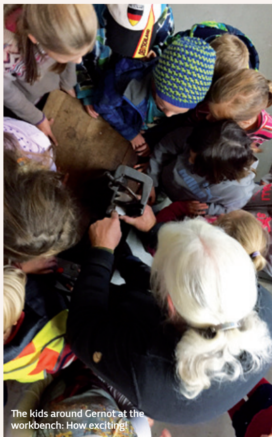
The kids around Gernot at the workbench: How exciting!