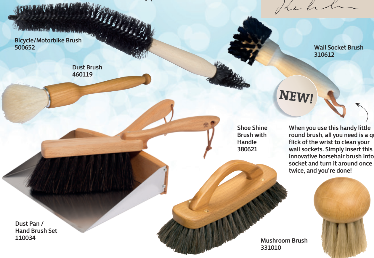
Mushroom Brush 331010