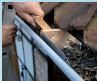
Gutter Shovel 306020

Clean gutters easily with the right tool!