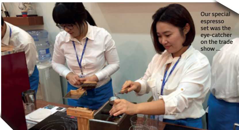
Our special espresso set was the eye-catcher on the trade show ...