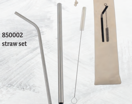
850002 straw set