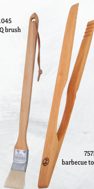
757546 barbecue tongs