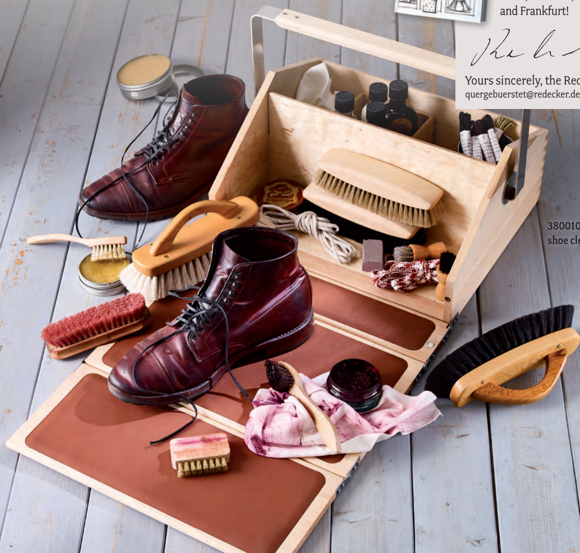
380010 shoe cleaning box

Yours sincerely, the Redeckers quergebuerstet@redecor.de