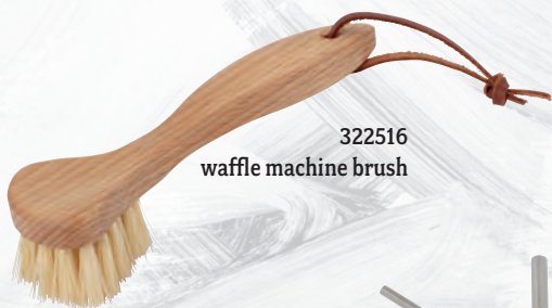
322516 waffle machine brush