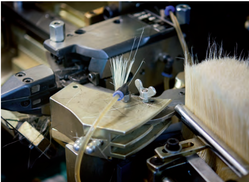
Shown to the left: The tip of the punch, which is supplied with a bundle of bristles from the reservoir to the right. In the middle, a bundle of bristles on the way to the punch.