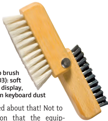
Laptop brush (460003): soft on the display, hard on keyboard dust