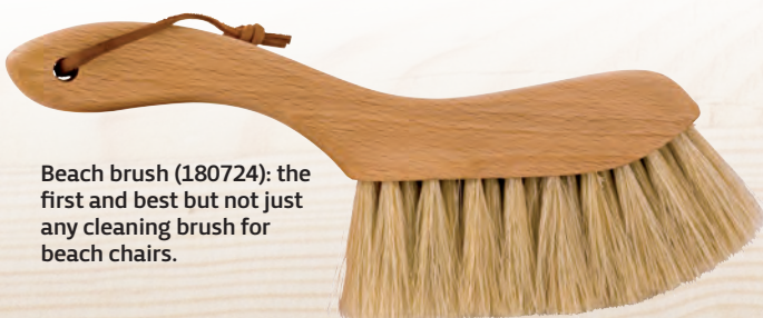
Beach brush (180724): the first and best but not just any cleaning brush for beach chairs.