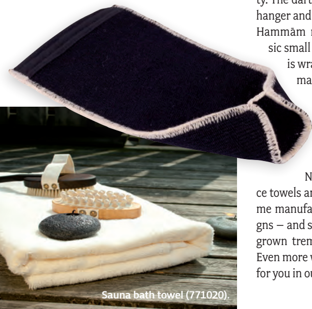
Sauna bath towel (771020).

Massage glove (610125): ingeniously simple, practical and beautiful.