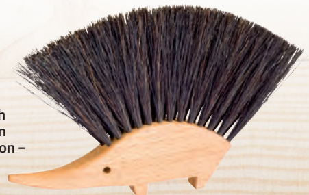
Hedgehog tabletop brush (421110): form follows function – with a smile.