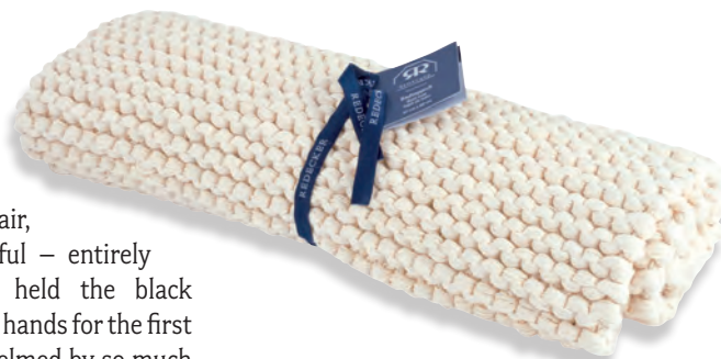
Bath mat (774560): fleecy, soft, hand-knitted.