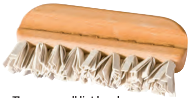
The new small lint brush (434014): always ready to fight lint and pet hair