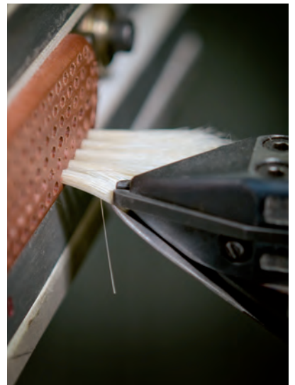
Bottom: The bundle along with the wire loop has been punched into the body.