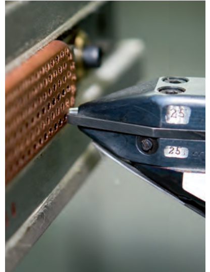
Top: The punch on the way to the brush body – the wire loop with the bundle of bristles is already inside.

In the meantime, the machine has assumed its permanent place in the workshop: it produces. Around it, employees in the workshop are pursuing their usually complex, manual tasks: they cut on the band saw, apply oil at the vat, they emboss and punch leather, they grind, inspect and cut. Machines are used throughout the workshop – as a means to an end. The quality of a handmade brush cannot be reproduced by a machine. This is clear to everyone here. The product is made by people. That is good, and not about to change.