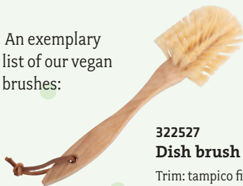
322527 Dish brush Trim: tampico fibre