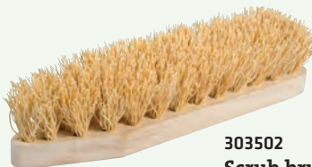
303502 Scrub brush Trim: root