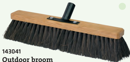
143041 Outdoor broom Trim: arenga fibre