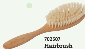
702507 Hairbrush Trim: tampico fibre