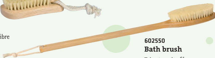
602550 Bath brush Trim: tampico fibre