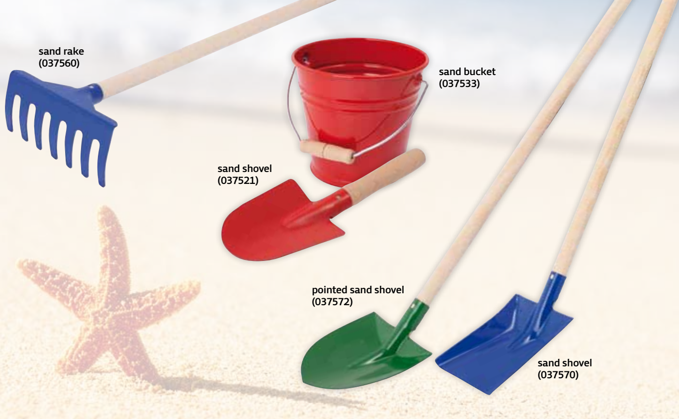
sand rake (037560)