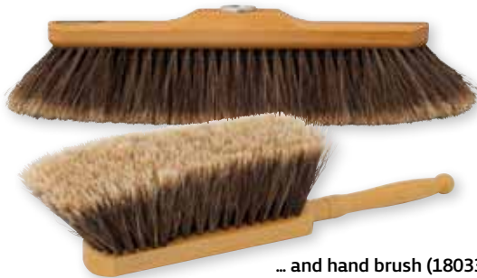
... and hand brush (180330) made from slit horsehair.

are a nice example of our quality standards. The hairs are slit at both ends in a mechanical process, which makes them much more flexible and softer so they are perfect for use against fine and ultra fine dust. →