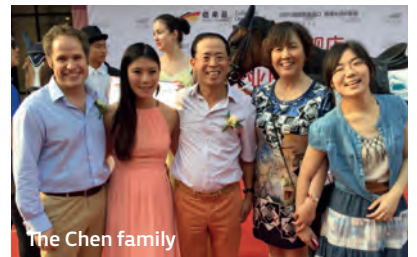
The Chen family