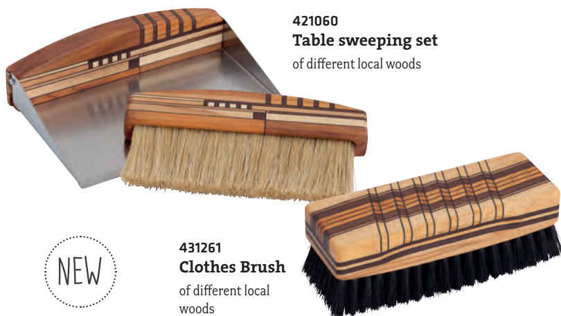
421060 Table sweeping set of different local woods

Another idea that has long been planned could finally be implemented: our new Multiwood series is being produced in cooperation with a German intarsia manufacturer and shows the entire colour diversity of our local woods. While many make the multi-coloured wood work even more colourful by dyed or tropical woods, we will, of course, only use woods from European production. They are already a treat for the eyes in contrasting colours and grains.