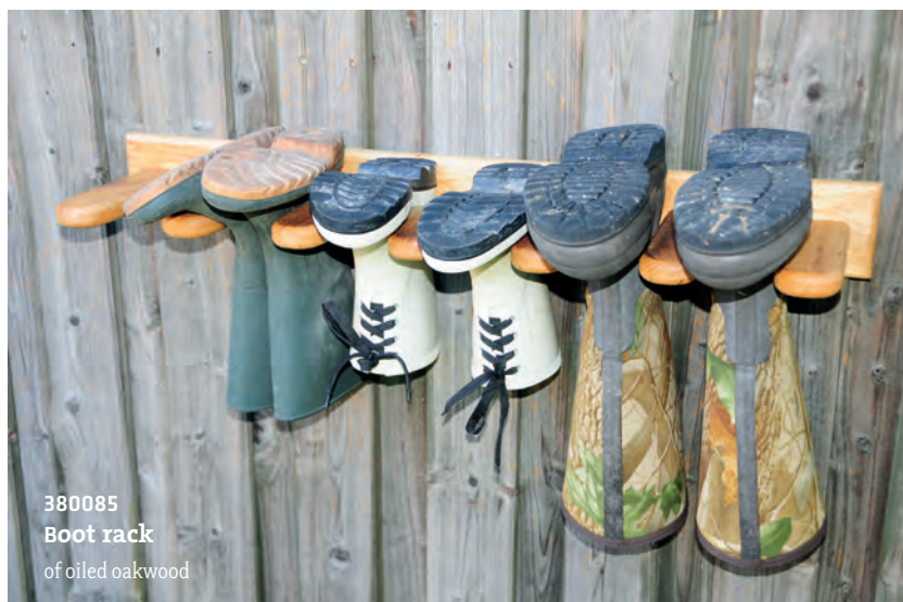
380085 Boot rack of oiled oakwood