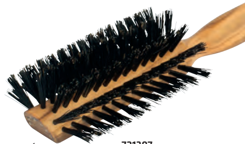
721307 Hand drawn hairbrush waxed olive wood with Calcutta bristle