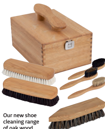
Our new shoe cleaning range of oak wood

Another new offer is the beautiful shoe shining oak wood series. Nearly all the tried-and-tested wide and narrow Redecker shoe brushes are now also available in an oiled oak quality. Additionally, there is a boot holder strip as it used to be found in every front room or scullery: Unbreakable oak wood holds everything from the smallest child's wellington boot to the grown man's leather one, letting them dry safely.