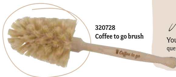
320728 Coffee to go brush