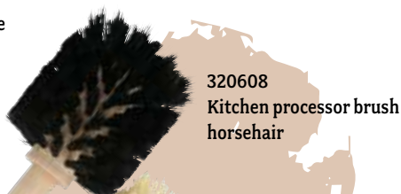
320608 Kitchen processor brush horsehair