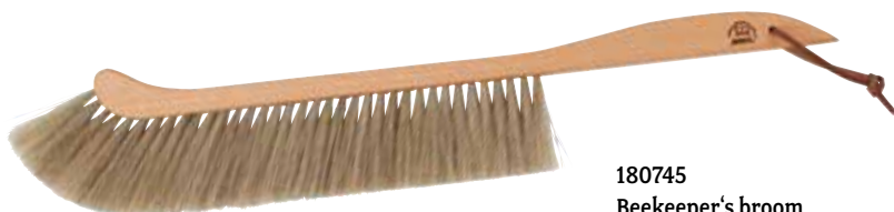
180745 Beekeeper's broom