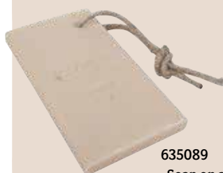
635089 „Soap on a Rope“