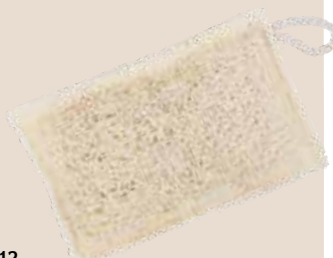
253512 Loofah dish washing sponge

The plastic-free life is made even easier with the ingenious "Soap on a Rope" dishwashing soap: simply go over the suspended soap board once or twice with the damp dishwashing brush - that's it! We have also brought along a natural alternative to the conventional dishwashing sponge. Our dishwashing sponge consisting of 100% loofah is not only visually appealing.