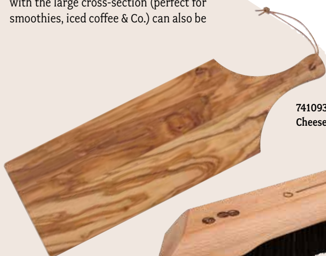
741093 Cheese board

Have you already seen our new pool table brush? With its branding not only a real eye-catcher that will bring you admiring glances as a billiard professional, but also a solid and well thought-out piece of quality: with the harder bristles at the tip and at the end, billiard aficionados will get into every corner to remove chalk residue and dust. With the return of the passion for knitting, crocheting, darning, two handicraft classics have also returned: the darning mushroom and the good old darning egg are back!