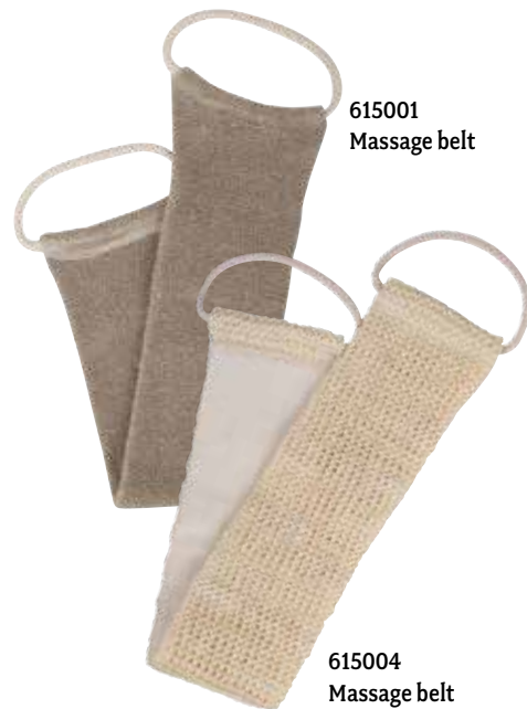
615001 Massage belt