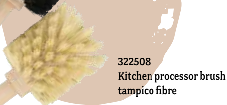
322508 Kitchen processor brush tampico fibre