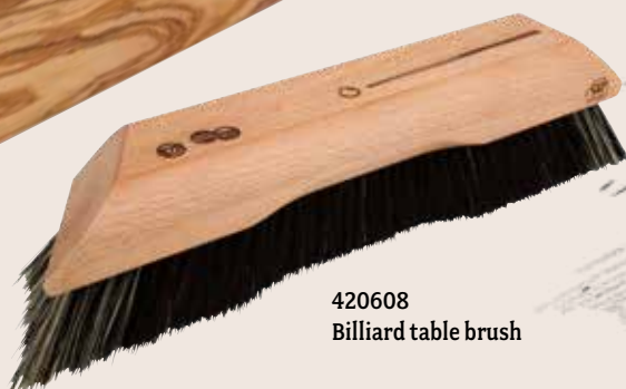
420608 Billiard table brush