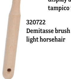
320722 Demitasse brush light horsehair