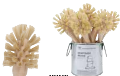
102522 Demitasse brush in a metal display unit tampico fibre

Again and again we are approached by customers and dealers when the right tool is simply not available for certain purposes: From these suggestions we have conjured up a number of products which, to our knowledge, are not available anywhere else. The Kitchen Machine Brush is ideal for all deep mixing bowls of multi-functional kitchen machines and, with its round shape and straight underside, is guaranteed to clean the bottom of every pot. The small cup brush and the coffee to go brush have long been on our list - now they are finally here! And many have been waiting for the round tea strainer brush for removing stubborn or dried tea leaf residues. ▶