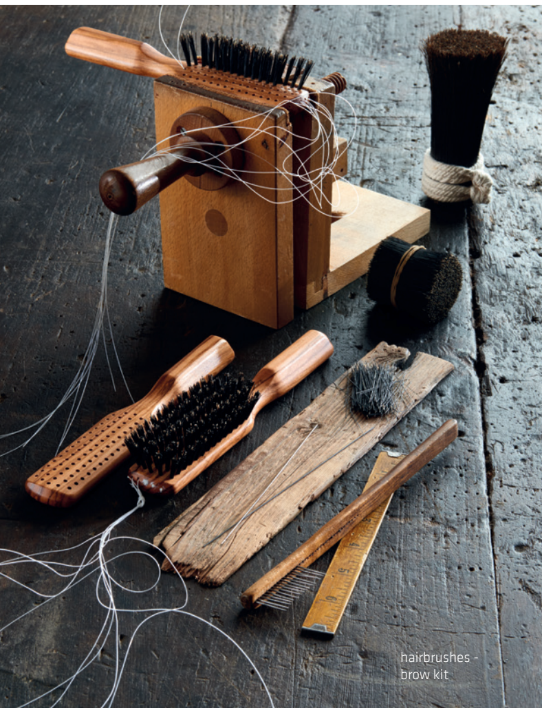
hairbrushes - brow kit