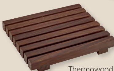
Thermowood soap tray Size: 12 x 10 cm, oiled thermowood 737575