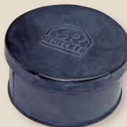
Soap box with lid Size: Ø 8,3 cm x 4,3 cm, black galvanised metal 637001