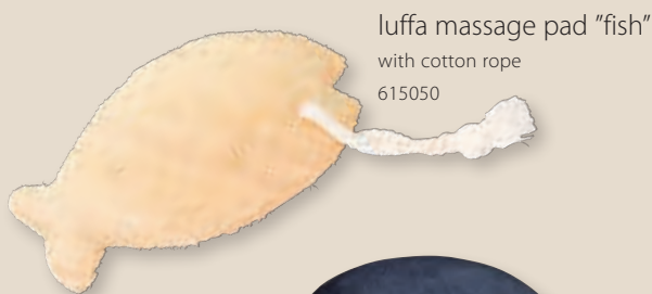
luffa massage pad "fish" with cotton rope 615050