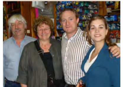
The Redecker family