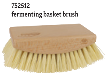
752512 fermenting basket brush