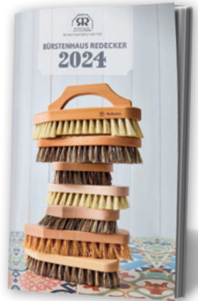
180398 hand brush

Our new highlights focus on everyday items that not only make our lives easier, but also more beautiful! The new hand brush with matching dustpan, for example: a real designer piece that not only looks great, but is also more practical and ergonomic than others. ▶