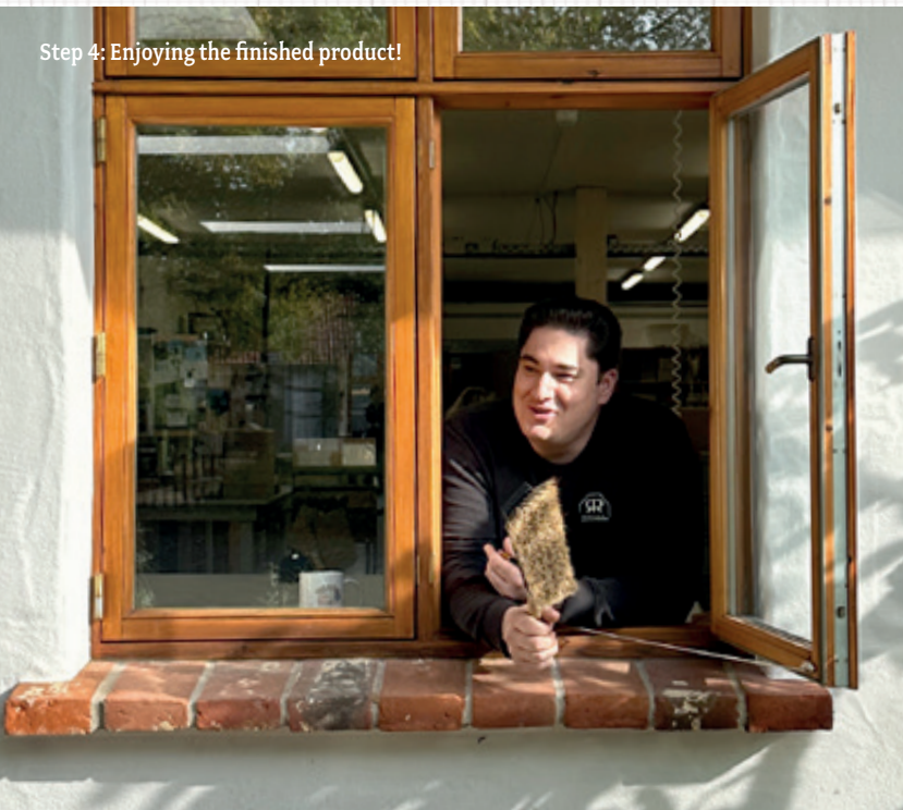
Step 4: Enjoying the finished product!