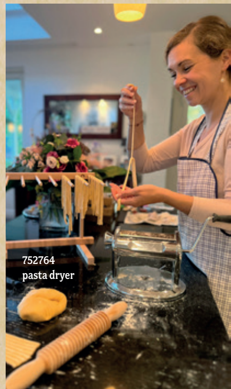
752764 pasta dryer