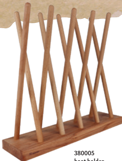
380005 boot holder