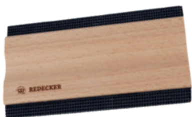
438510 lint comb/lint remover

Aren't they adorable? Our new, completely self-designed and manufactured children's nail brushes are just the right size for small children's hands who have yet to learn how to clean their nails. The individual motifs are lovingly hand-drawn illustrations that are lasered onto the wooden body. Also means: only wood, bristle and linseed oil, no chemicals or paint involved! Their big sisters, our new oak nail and massage brushes, have also become real beauties, we think. The great grain in the oak wood comes out even better when the brushes are used wet, which of course they don't mind. However, we have fallen in love with our new gray-green water pitcher, which also comes with a storage tray. Together with warm wood tones such as oiled beech or oak, this is a dream team for us in the bathroom and is always a little moment of joy when we walk in.