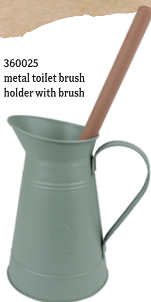
360025 metal toilet brush holder with brush