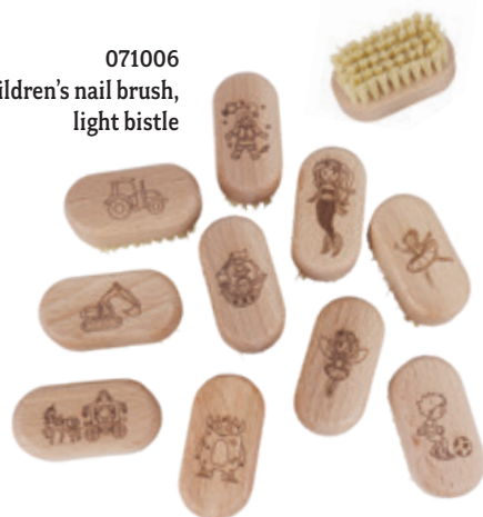
071006 children's nail brush, light bistle