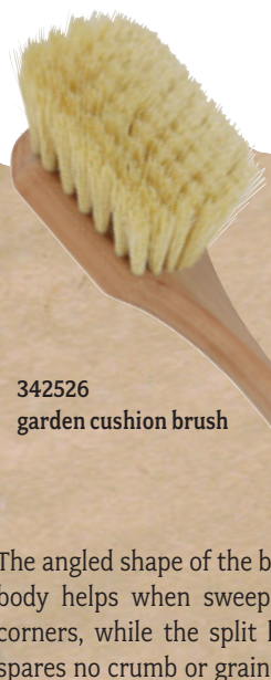
342526 garden cushion brush

The angled shape of the brush body helps when sweeping in corners, while the split horsehair spares no crumb or grain of dust. The ergonomic handle made of oiled oak wood makes it easy to hold – be sure you don't hide it in the cupboard! The set looks great hanging on the kitchen wall. Several other specialized brushes that many have been waiting for are finally here: the robotic lawn mower brush set on a ring, a special garden upholstery brush (quickly remove dirt, pollen and leaves from upholstery!) and – perfect gift for bread bakers! – our fermenting basket brush not only makes life easier, it also looks great. ... and why didn't we come up with the idea of inventing a