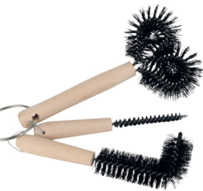
303303 lawn mower/robot brush set