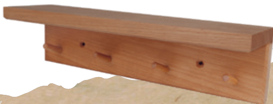
023804 wall mount with shelf